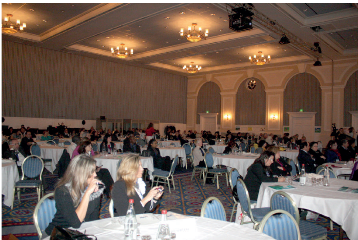
Audience during the WFS+6 Plenary Sessions