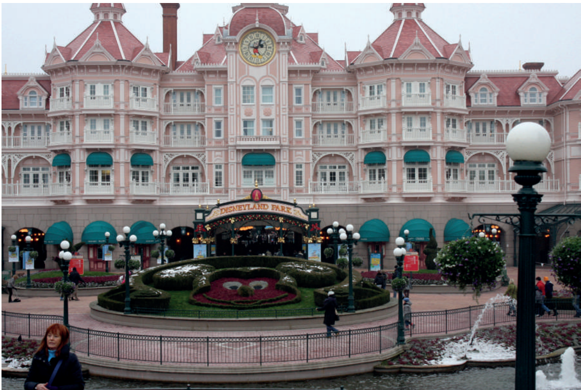
Disney's Newport Bay Club – venue of the World Family Summit +6