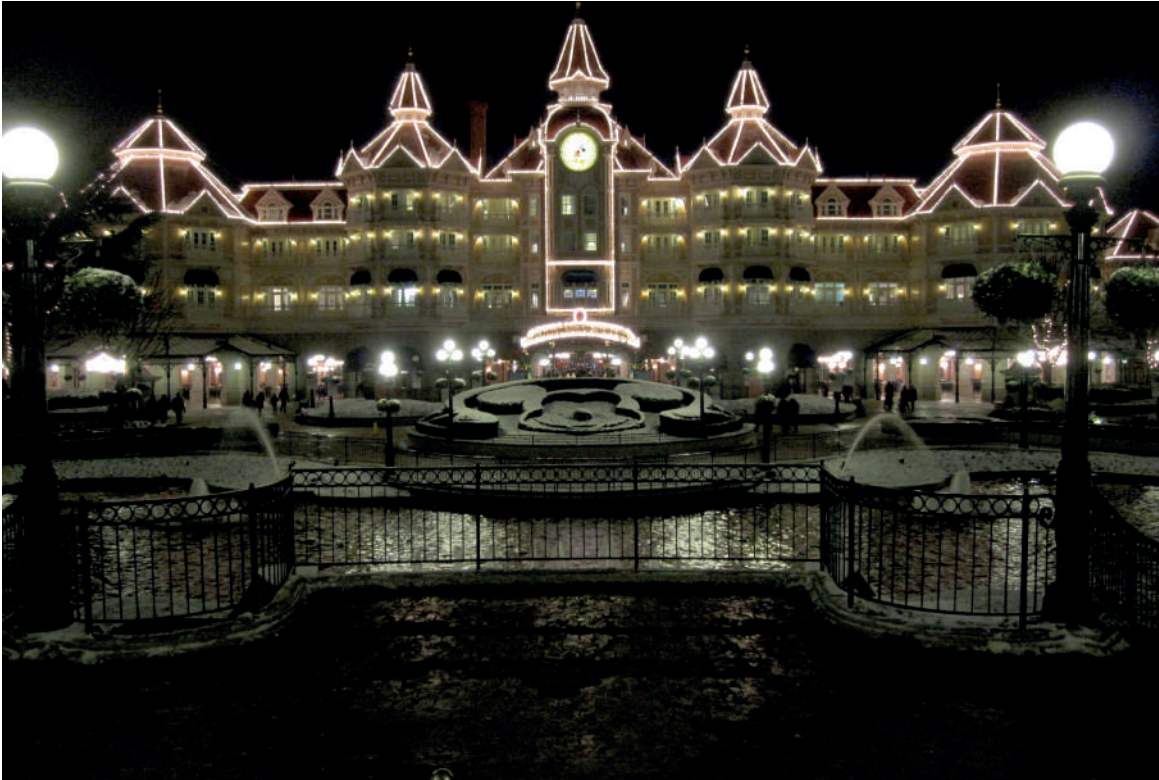
Disney's Newport Bay Club – venue of the World Family Summit +6