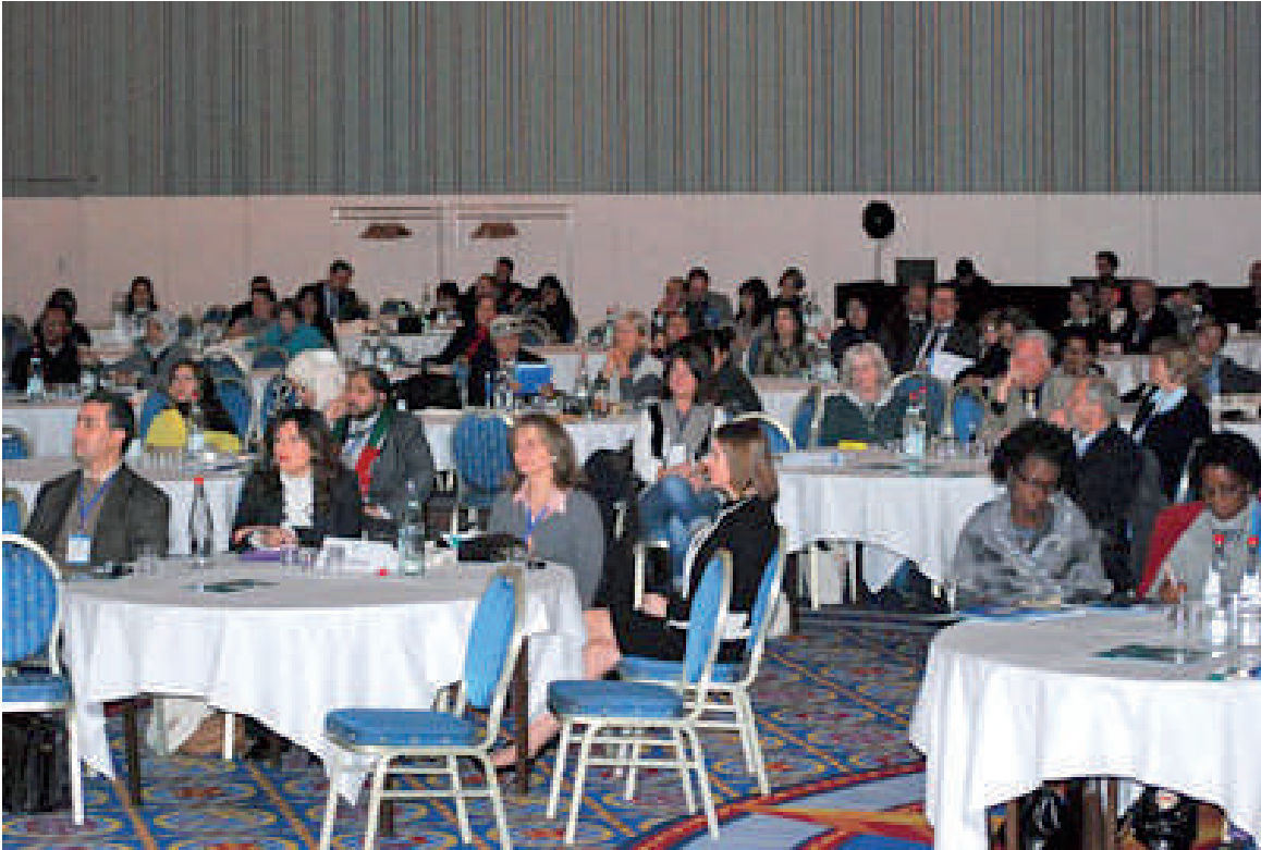
Audience during the WFS+6