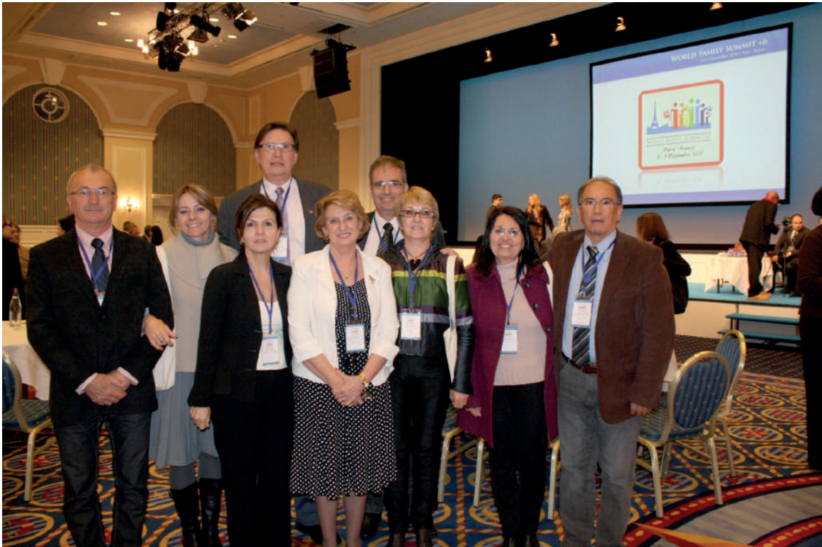
Part of the UNAPMIF Delegation at the WFS+6