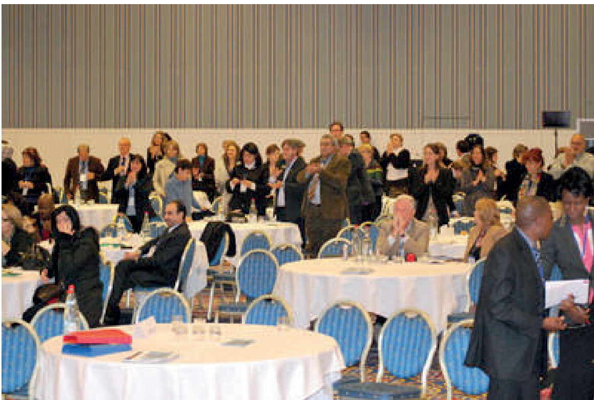
Audience during the WFS+6 Opening Ceremony