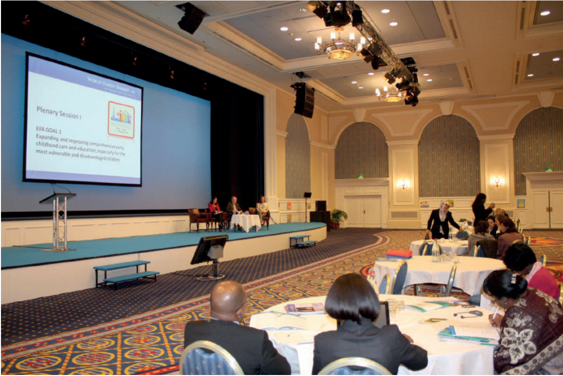
Plenary Session I – WFS+6