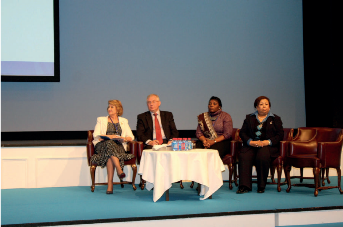
Plenary Session VII – Conclusion and Recommendations