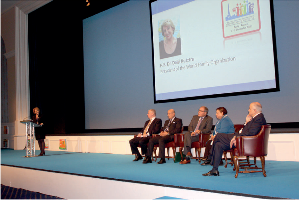
Opening Ceremony of the WFS+6