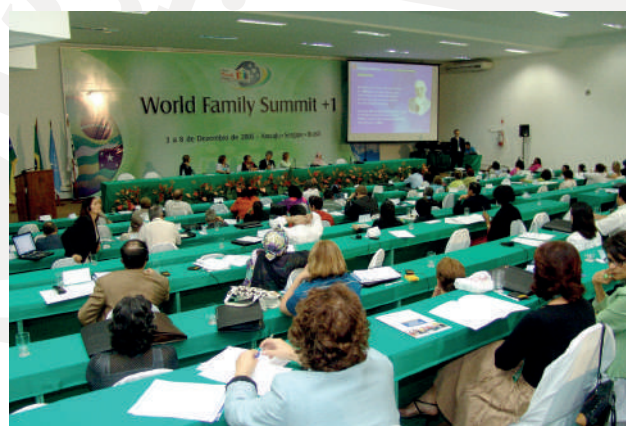
Plenary Session Aracaju