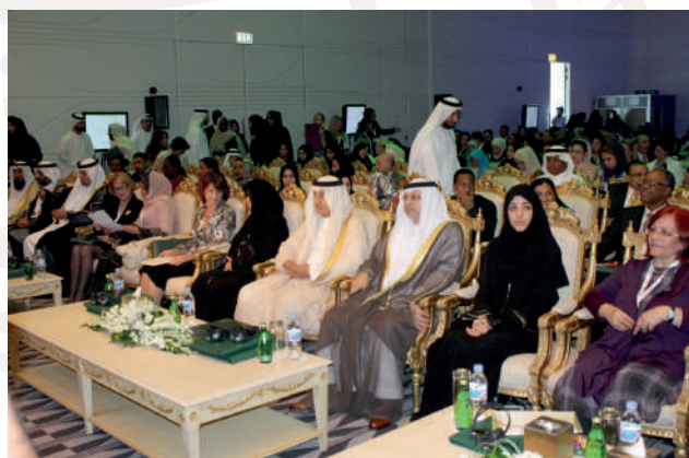
Audience during the Ministerial Roundtable