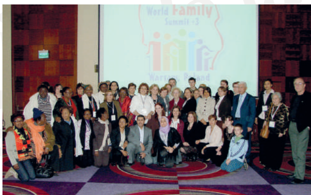
World Family Summit +3 Group photo