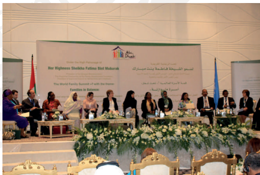
Ministerial Roundtable World