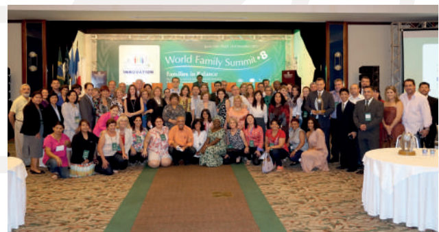
Final Group Photo