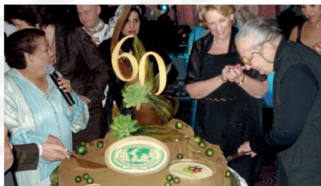
Celebration of WFO's 60th Anniversary during the WFS+3