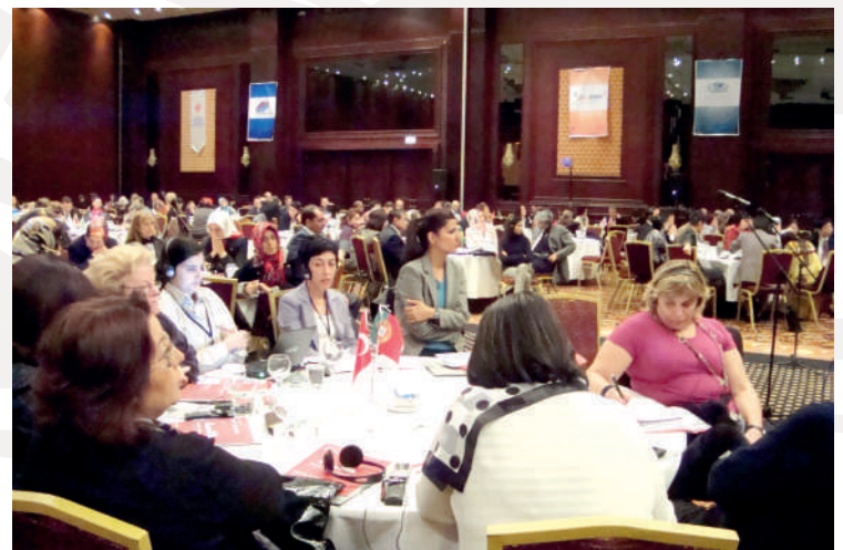
Audience during the WFS+5 Opening Ceremony