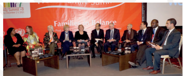
Special Panel at the Opening Ceremony