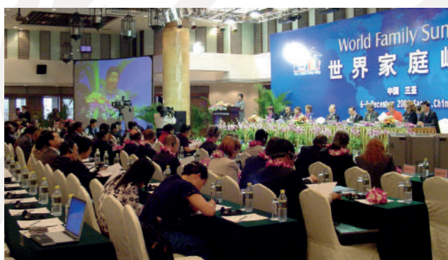
Opening Ceremony World Family Summit, Sanya, China 2004