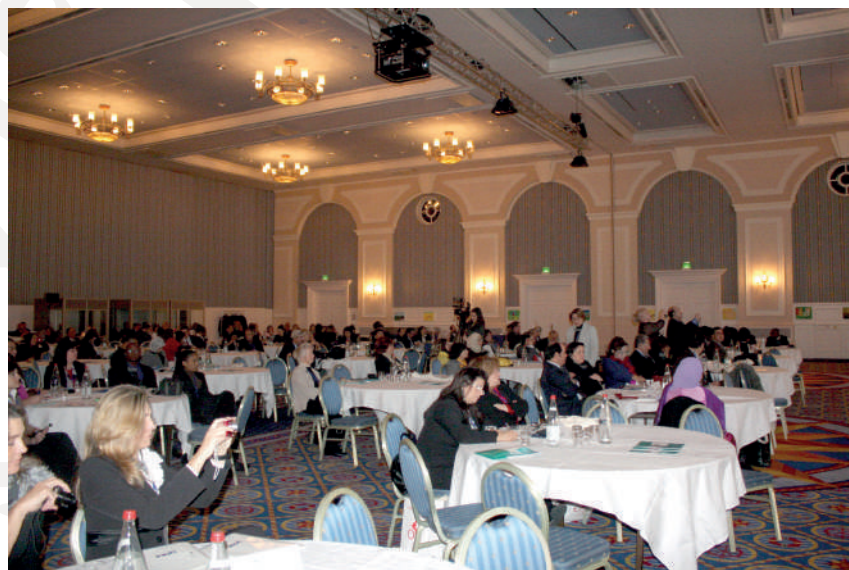
Audience during the WFS+5 Opening Ceremony