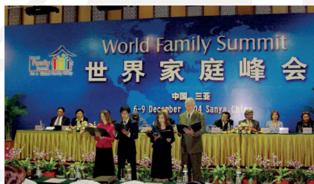
Family reading the final text of the Sanya Declaration