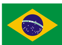
Brazilian Government Ministry of Social and Agrarian Development