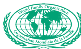
World Family Organization