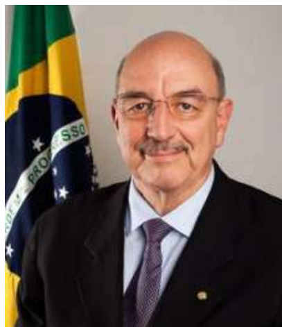
H.E. Dr. Osmar Terra Minister of Social and Agrarian Development | Brazil