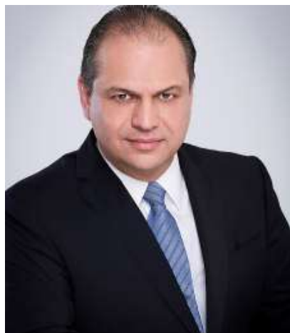
H.E. Mr. Ricardo Barros Minister of Health | Brazil