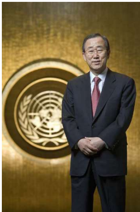
UN Secretary General BAN Ki-moon