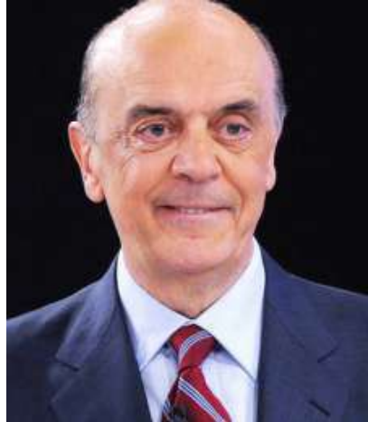
H.E. Dr. José Serra Minister of Foreign Affairs | Brazil