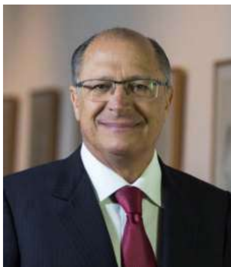
H.E. Dr. Geraldo Alckmin Governor of São Paulo State, Brazil