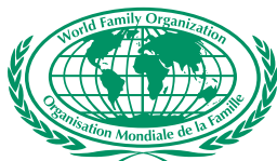
World Family Organization