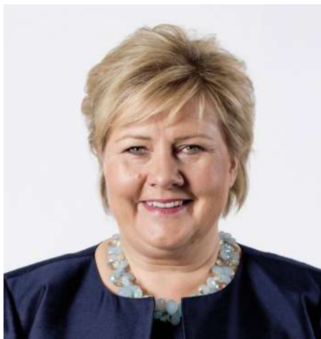
H.E. Mrs. Erna Solberg